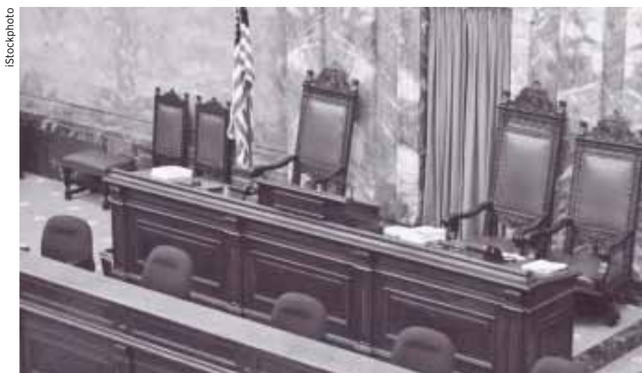
THE U.S. CONSTITUTION requires that any bill raising revenue must originate in the House of Representatives.

This question arouses much debate among economists, politicians, and others. Some economists believe the following is likely to happen if large federal budget deficits continue to cause the public debt to soar over the next few decades: The U.S. public debt-to-GDP ratio may reach a “tipping point” when investors decide the U.S. is no longer a safe bet to pay off what it owes. They may demand very high interest for Treasury securities, or they may refuse to buy them at all. As a condition for lending any more money, investors may force the government