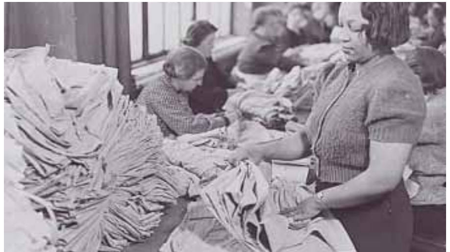
WOMEN WORK in a WPA sewing room in New York City.

Henry Morgenthau, Roosevelt’s secretary of the treasury, recommended cutting spending and balancing the federal budget. Morgenthau argued this policy would gain the confidence of businesses to invest in the ►