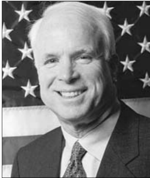
Senator John McCain, a Navy pilot in the Vietnam War, is pressing for a bill that bans “cruel, inhuman, or degrading treatment or punishment” of anyone in U.S. custody.

The Bush administration denies that it outsources torture. President Bush has stated: “Torture is never acceptable, nor do we hand over people to countries that do torture.”