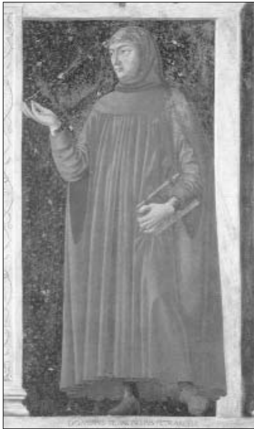
Petrarch (1304–1374), an Italian poet and scholar, was a devout Christian who loved the culture of ancient Rome.

European scholars did not have access to many ancient Latin and Greek writings. For exam-