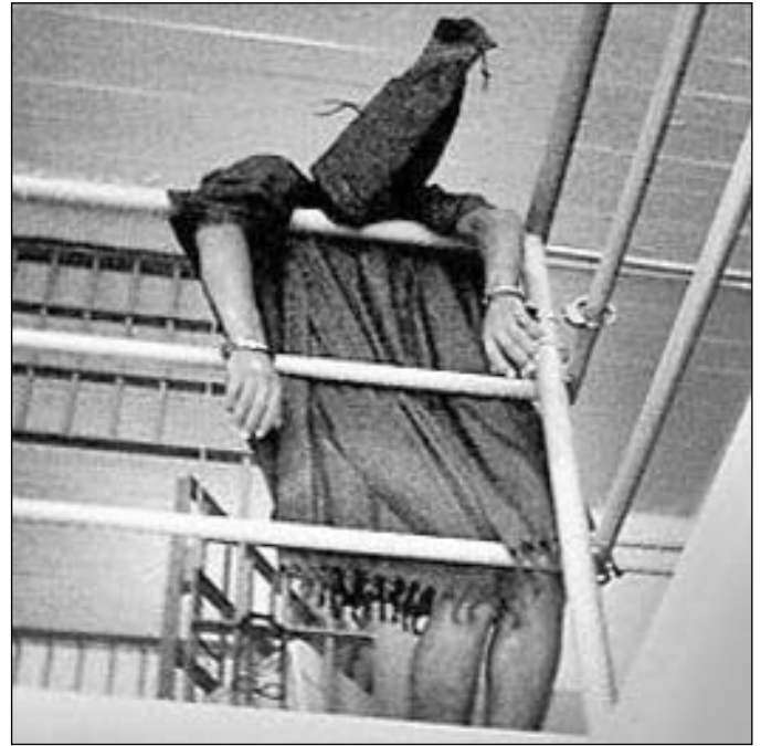
In April 2004, the public first saw pictures of mistreated detainees in U.S. custody at Iraq’s Abu Ghraib prison.

Still others think that if the situation merits torture, the agents should be willing to risk going to prison. Would a prosecutor dare charge them with crimes if they saved the lives of thousands? If charged, the agents might be able to raise the defense of necessity, that they did something wrong to prevent a far greater wrong. If they were convicted, the president might pardon them.