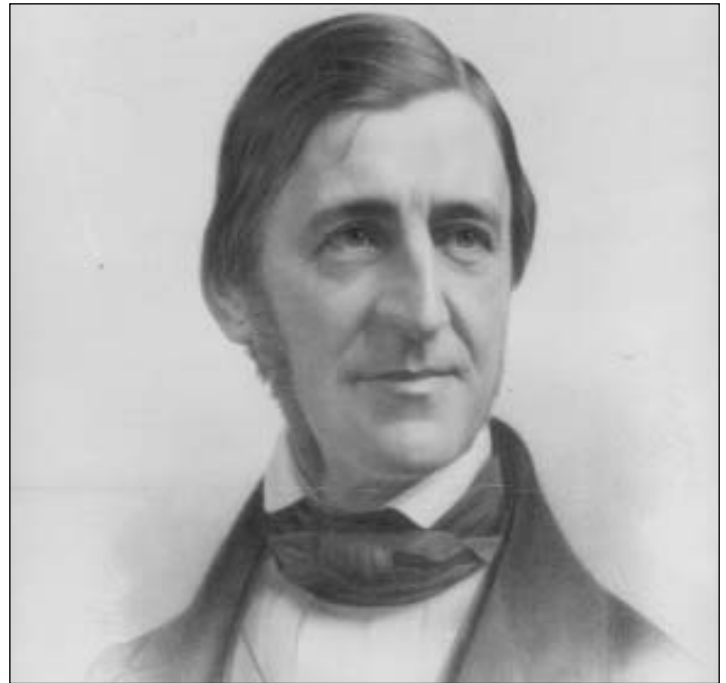
Ralph Waldo Emerson (1803–1882), a clergyman, writer, philosopher, and orator, founded the school of thought known as Transcendentalism.

Called the Transcendental Club, Emerson's group of Boston and Concord followers soon established a new religious, philosophical, and literary movement. At first focusing on the "inner self," many Transcendentalists eventually become deeply involved in social reform.