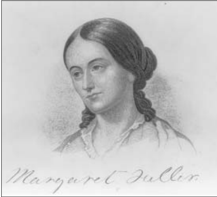
Margaret Fuller (1810–1850), a writer and orator, was a leading Transcendentalist. She often spoke and wrote about women's rights.

rights, he said, they should not have to pay any taxes. These were radical ideas.