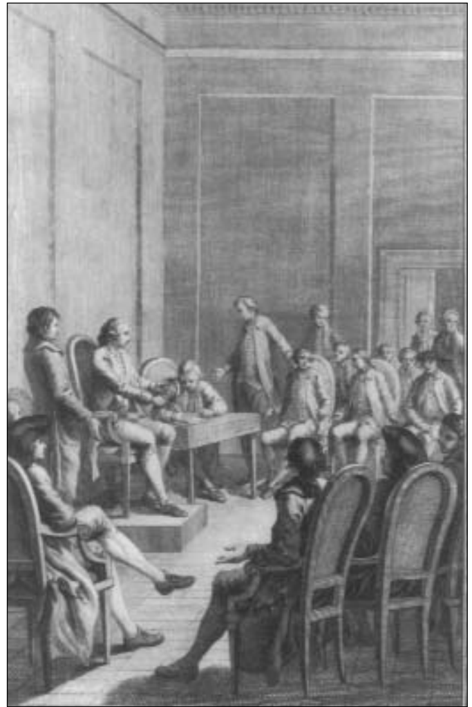
In 1774, the First Continental Congress assembled in Philadelphia.

A second Continental Congress met in May 1775, and Congress began advising the colonies on how to set up new state governments without royal governors and judges. On July 4, 1776, Congress issued the Declaration