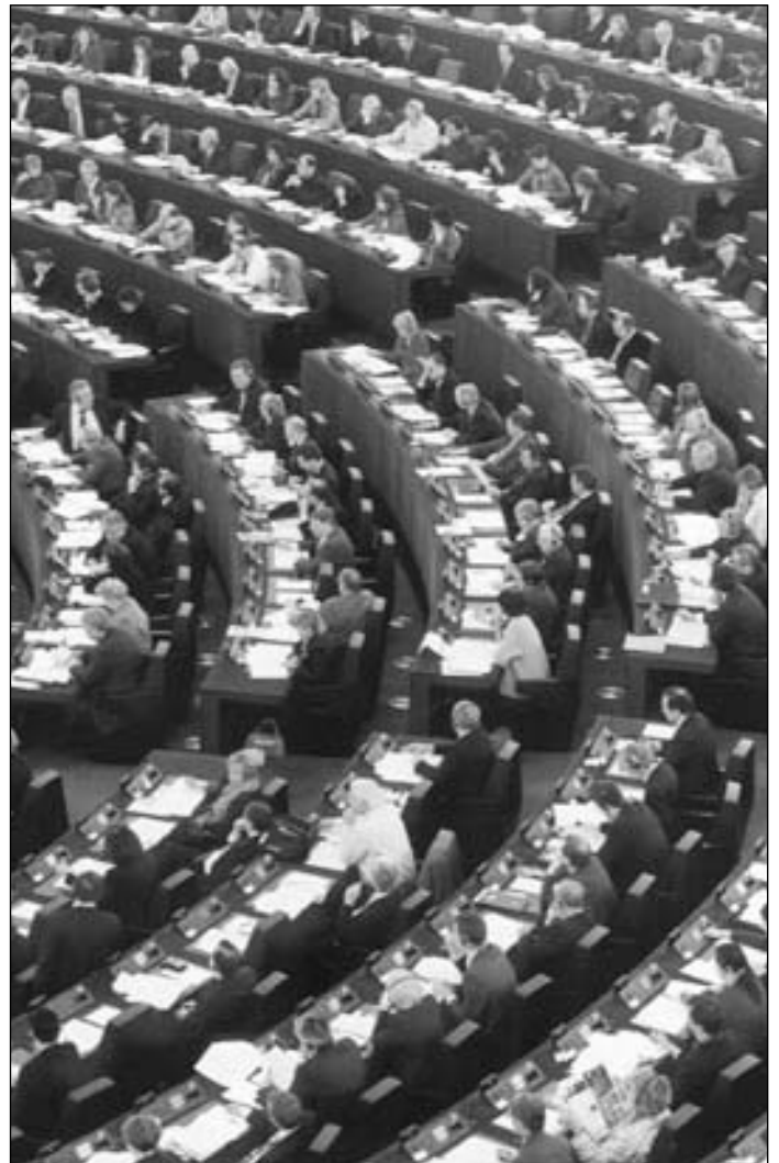
More than 600 members sit in the European Parliament. Each is elected to a five-year term.

Backed by the United States, the European Coal and Steel Community began in 1952. Six European nations joined as members: France, Germany, Belgium, Luxembourg, the