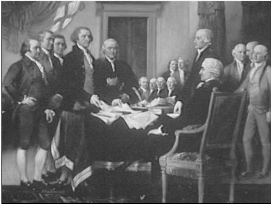
On July 4, 1776, members of Congress signed the Declaration of Independence. The new nation needed to set up a central government.

Members of Congress tried to address the war debt by introducing amendments that would allow Congress to impose import duties. In 1781, one such amendment almost passed, but it was defeated because one state, Rhode Island refused to give the unanimous consent required to amend the constitution. A similar