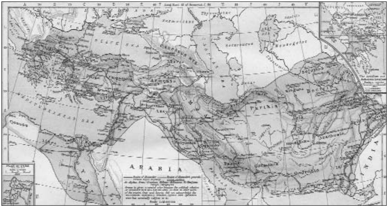
At its height, Alexander's empire spread from Greece east to India and south to include Egypt.

cataloged papyrus scrolls contained the writings of Greek and non-Greek philosophers, historians, playwrights, poets, scientists, and others. Athens sent Aristotle's personal library there after he died. The great library also held translations of the first books of the Hebrew Bible.