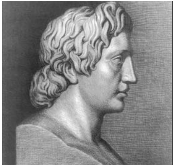
Alexander the Great (356–323 B.C.) created a vast empire and spread Greek culture to many lands.

In Gordium, there was a chariot with a complicated knot tied by an ancient king. According to legend, the one who could untie this knot would rule the world. Many had tried, but all had failed to untie the Gordian Knot. Alexander solved the puzzle in his own direct way: He sliced the knot in two with his sword.